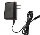
Device Power Adapter