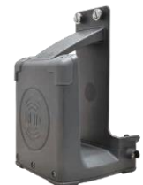
UHF Pistol Grip