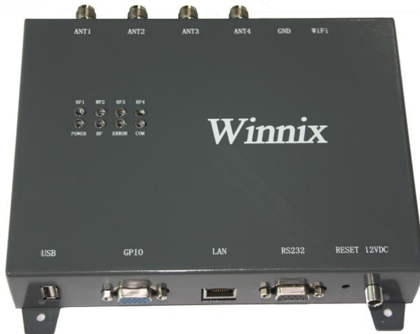
Picture1 Front view